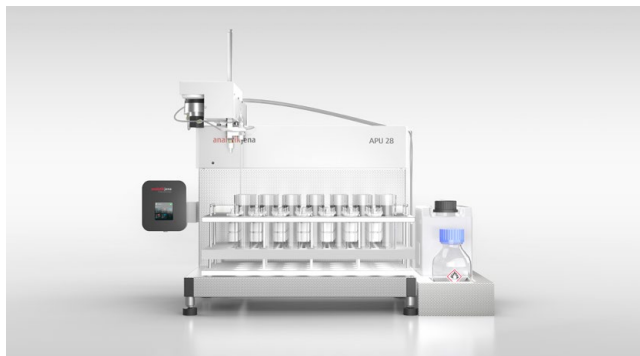
APU 28 connect

For the analysis of aqueous and solid samples (e.g., sludge, sediments), the AFU 3 enables the semi-automated preparation of up to three samples using the batch method. It is an excellent alternative to classic membrane filtration.