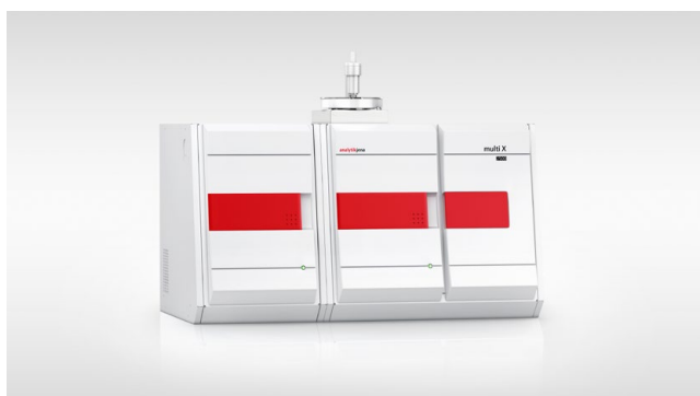
multi X 2500